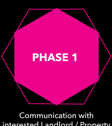
interested Landlord / Property Owner or Broker is made.