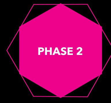
Zero Empty Spaces (ZES) Management visits location to gauge feasibility.