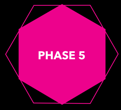
Zero Empty Spaces (ZES) Management gets space up to code and divides space into multiple studios if necessary