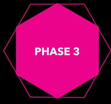
Standard Commercial Lease and Certificate of Insurance is provided with Landlord / Property Owner listed as Additional Insured.