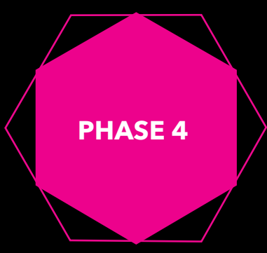
Landlord / Property Owner signs lease and gives keys to Zero Empty Spaces (ZES) Management.